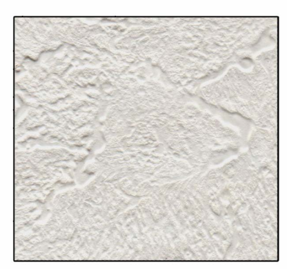
RUFF STUFF WHITE